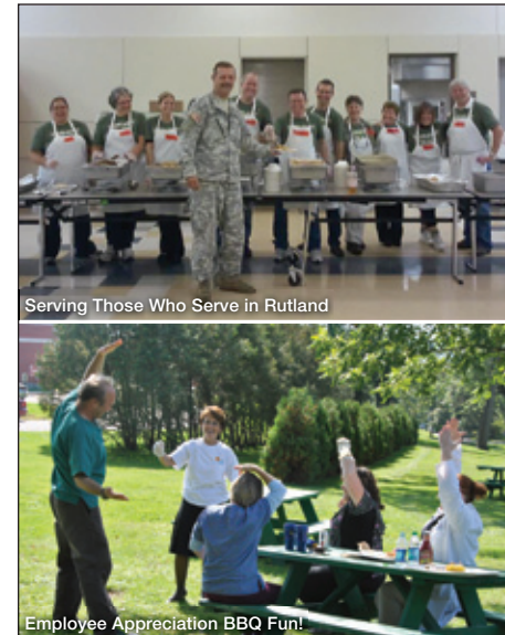
Serving Those Who Serve in Rutland

{ Work. Life. Balance. } we do that here.